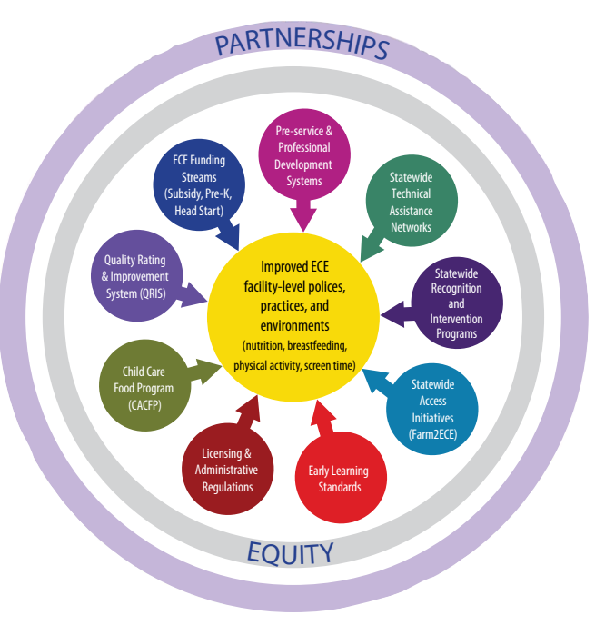
Figure 1: CDC Spectrum of Opportunities (2.0)

stakeholder groups) is described as an important contextual factor for integration activities.